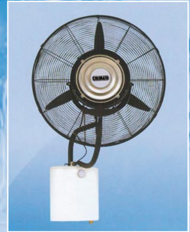
WALL TYPE SERIES